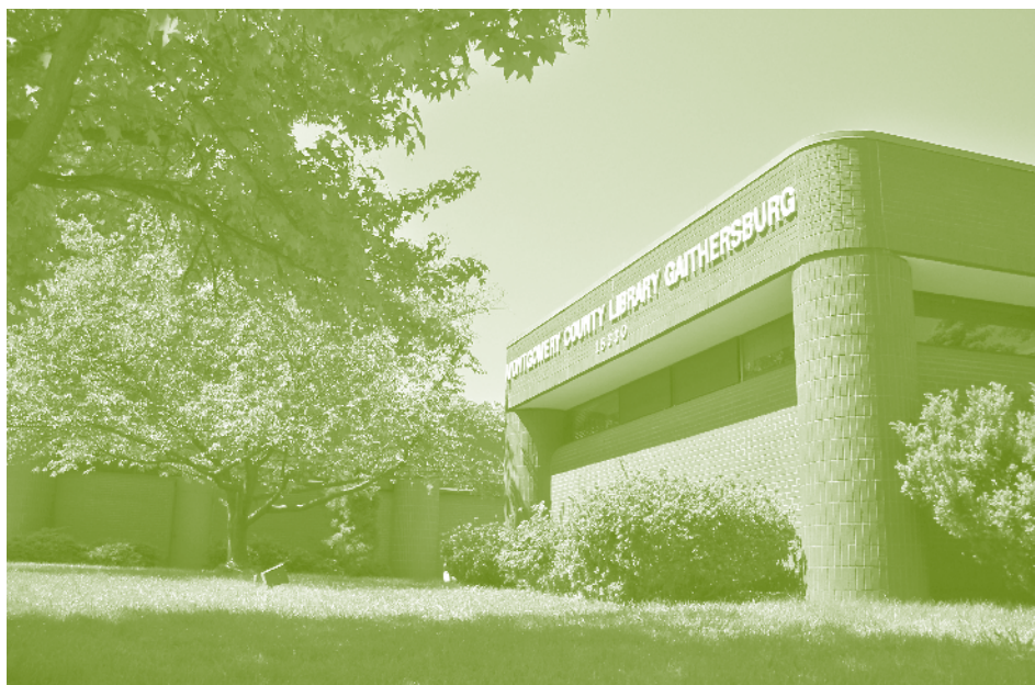
LEFT: The Gaithersburg Library is closed for much needed renovations.

21 Maryland Avenue, Suite 310 Rockville, MD 20850 | 240-777-0020