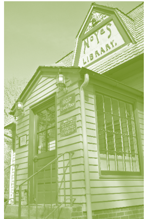
The Noyes Library is being kept open with the assistance of the Noyes Foundation, who is funding operating costs.

If you're already a member, you can help fund libraries by donating to and shopping at any of our three bookstores in Rockville, Wheaton, and Gaithersburg.