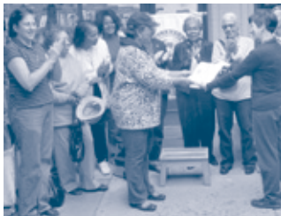
FOLMC thanks the members of ALTRUSA for their hard work and generosity.

The Gaithersburg store was extremely fortunate this past October to benefit from the wonderful people of the Montgomery County chapter of ALTRUSA, who generously donated well over 2,000 books in a single day! The books ranged from thrillers and romance to first editions and children's selections. The piles were quite impressive to see, and our patrons greatly appreciated the new titles. We're grateful to the members of ALTRUSA who put forth the effort to gather the books and donate them to our stores.