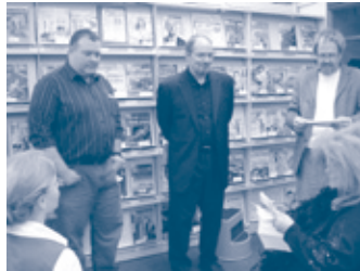
Mystery Party 2009