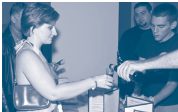
The breweries provided samples to patrons in FOLMC's commemorative mini-pilsner glasses.

Austin Grill Clyde's Giant Fractured Prune La Tasca Spice Xing