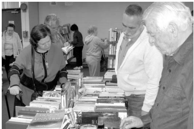
Book lovers browse through thousands of titles at the Aspen Hill spring Book Sale

The Aspen Hill Chapter annual spring Book Sale on May 3 was a marvelous success. Over 1,500 books received new homes; friends and neighbors chatted about events going on in the community; and we raised money for library programs and services.