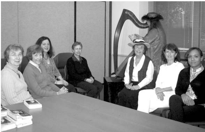
Jane Austen book discussion participants

This spring, we had several intriguing discussions of Jane Austen’s books that coincided with the PBS television show Masterpiece Theater . Thanks to all our patrons who participated.