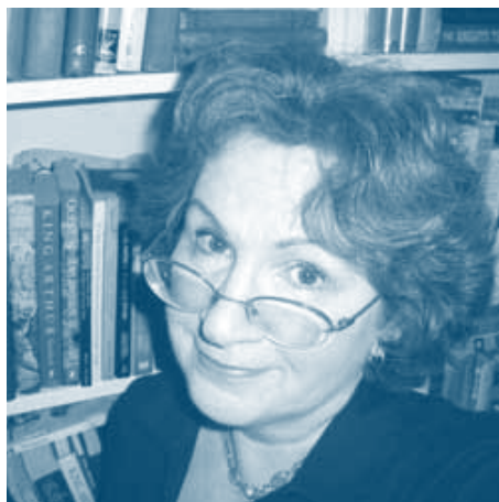
Susan Fraser King, bestselling author.

A review from Publisher's Weekly states: "King's blend of historical figures and fictional characters turn a medieval icon into a believable mother, wife and ruler. Quotes from original sources offer context and insight as to where the record ends and imagination begins."