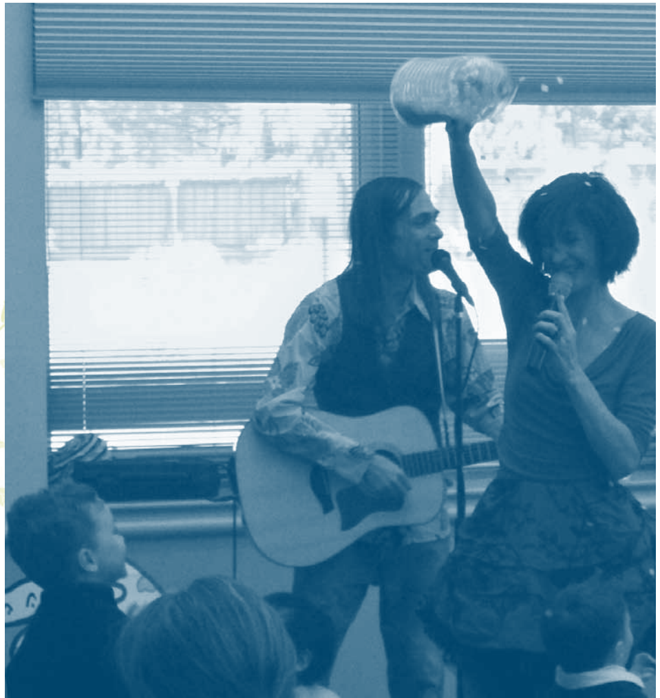
Grammy-nominated children's rock group Milkshake kicked off Library Lovers Month for 2011 with music, dancing, and a "bottle of sunshine."

In addition to FOLMC planned programs and events, FOLMC provides grants to MCPL that enhance existing library service (including minor building modifications), promote community outreach, and pilot new service or delivery methods. Specifically, FOLMC funded MCPL run children's and family programs throughout the county; Staff Development Day for MCPL employees; the Laptop Lounge in Wheaton to create a teen-friendly, safe space downstairs; a teen area in the Long Branch Library; receipt printers to boost productivity and enhance the customer's experience, as well as allow customers to go green; and portable circulation devices that allow libraries to assist patrons more readily and maximize the librarian's