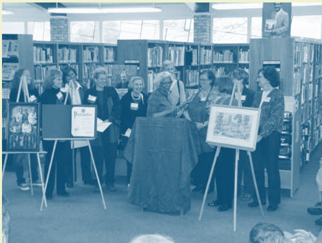
The FOL, LF Chapter and Library Advisory Committee members.

The Library hosted the very first "Little Falls Library Holiday Boutique" featuring a variety of vendors. A portion of the day's profits was donated to the Friends. The children's room was very busy with crafts and the helping hands of many Girl Scouts.